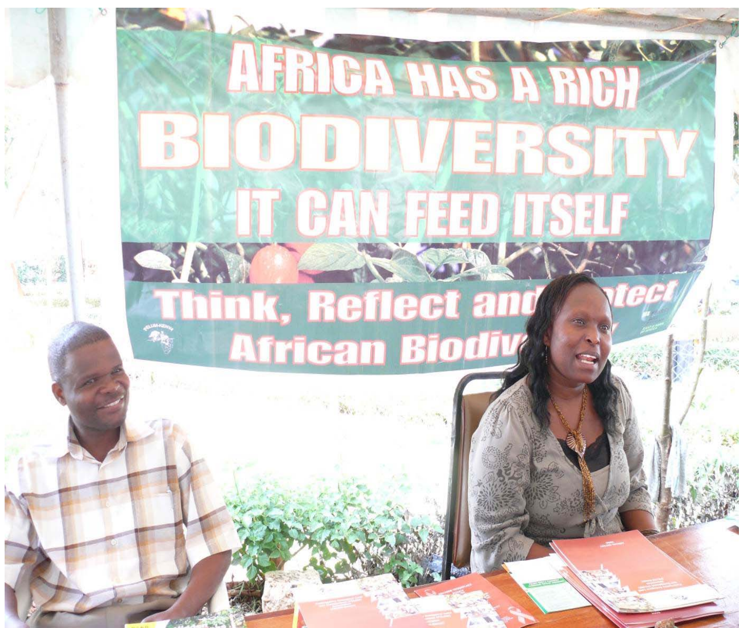
PELUM Network, Kenya

Foreign Investments in Agriculture - "Land Grabbing"